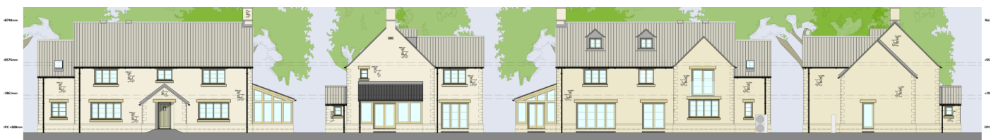
Fig 6 – 2022 Current Scheme