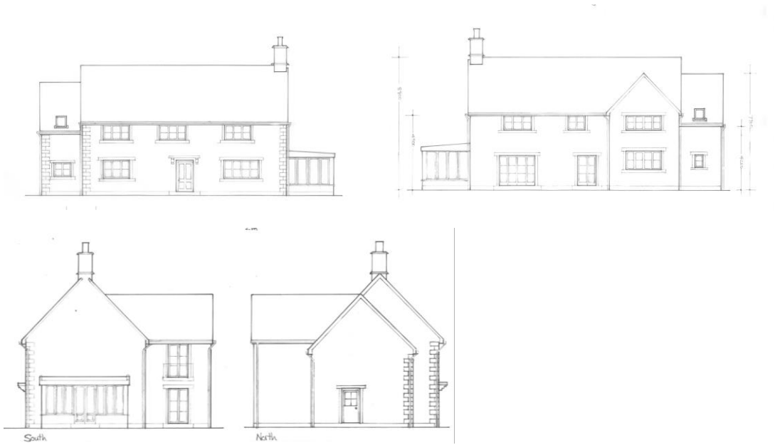
Fig 4 – 2018 Approved Scheme