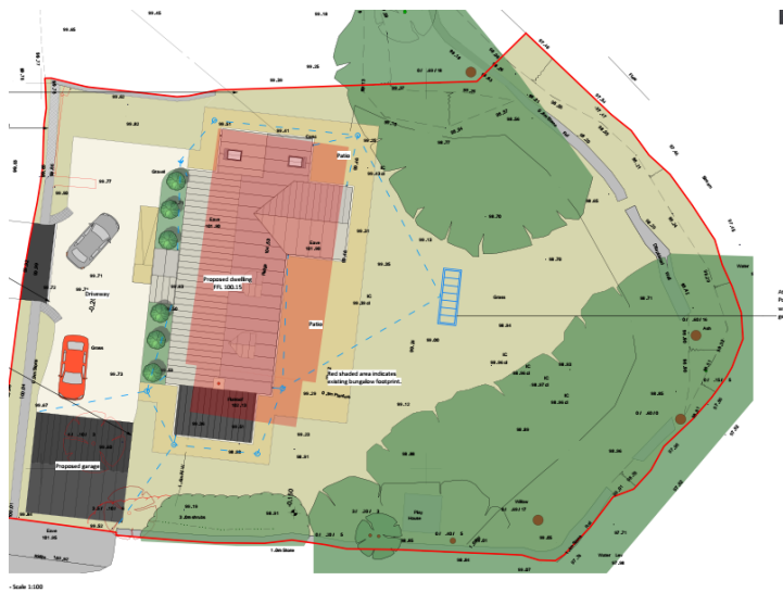
Fig 3- 2022 Current scheme