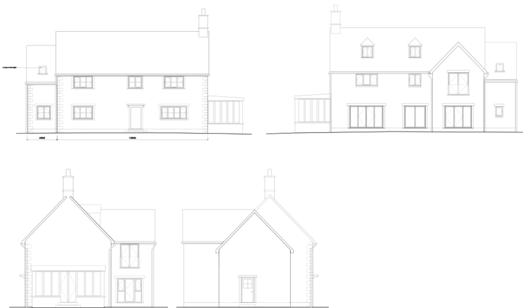
Fig 5 – 2021 Refused Scheme